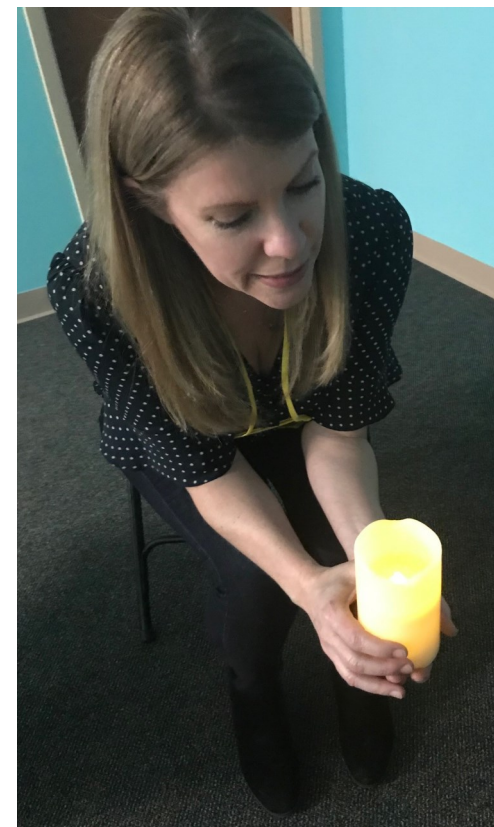
Children and youth find acceptance, support and understanding from their leaders and peers

Participants are encouraged to explore and express their feelings through activities, games and comfortable conversation