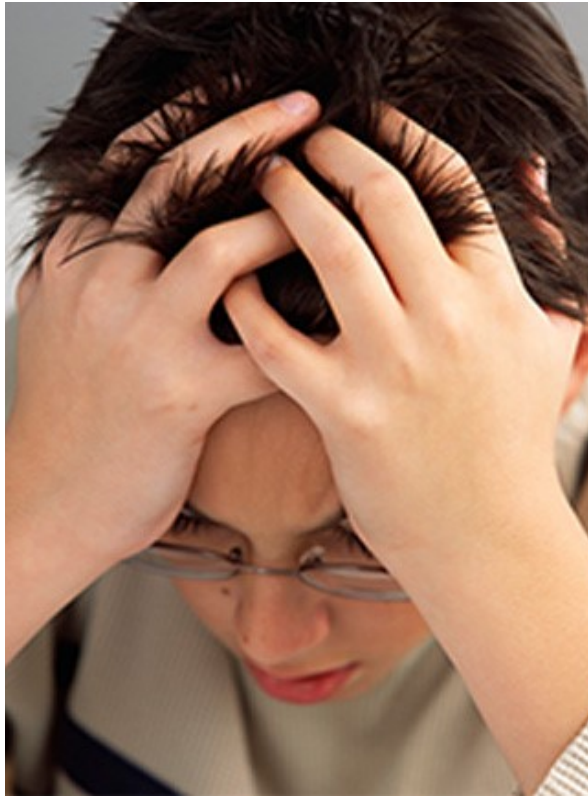
Children and youth find understanding, support and acceptance from their peers

Throughout the program, children are encouraged to explore their feelings in a safe environment